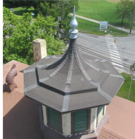
Cupola roof fair condition.